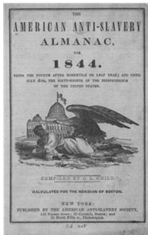
3. American Anti-Slavery Almanac for 1844 , cover.

Yet an almost exactly opposite use of classical imagery is made on the cover of the American Anti-Slavery Almanac for 1844. This offers an unmistakable allusion to the myth of Prometheus through the position of the vulnerable black slave mother, prone on the ground but shielding her baby from the onslaught of the aggressive eagle.