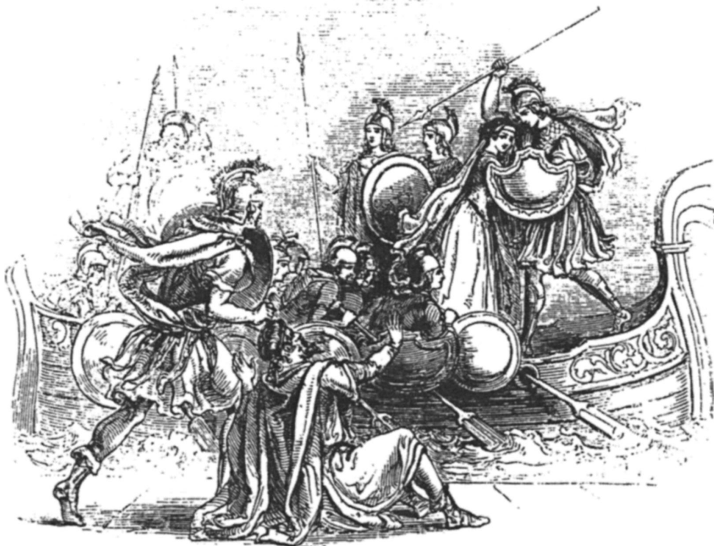
SCENE FROM THE EXTRAVAGANZA OF "THE GOLDEN FLEECE." AT THE HAYMARKET THEATRE.

Fig. 2. Jason and Medea flee in the Argo from Colchis. Conclusion of part 1 of J.R. Planché's The Golden Fleece . Engraving reproduced from the Illustrated London News , vol. 6, no. 152 (29 March 1845), p. 200.