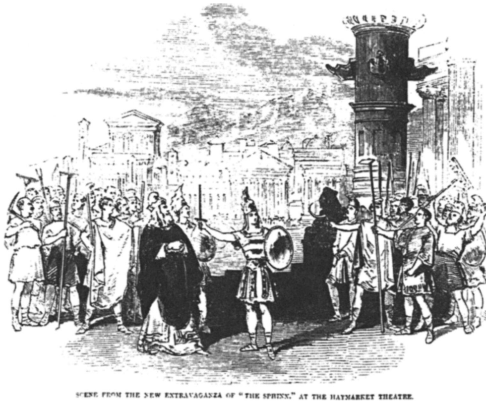
Fig. 3. Priscilla Horton as Oedipus in a Theban scene from the Brough brothers' The Sphinx . Engraving reproduced from the Illustrated London News , vol. 14, no. 366 (14 April 1849), p. 244.

Oedipus in the Brough brothers' 'wildly inventive' Sphinx (Haymarket, 1849: fig. 3). 70 Indeed, by the 1850s, both female-to-male and male-to-female transvestism was routine in burlesque. Older female roles, such as Clytemnestra or Medea, began systematically to be taken by men. 71 The male impersonation of women had emerged from the even lowlier subculture of the public houses, the circus, and the transvestite demimonde around the fringes of popular culture associated with sexual relations between men. 72