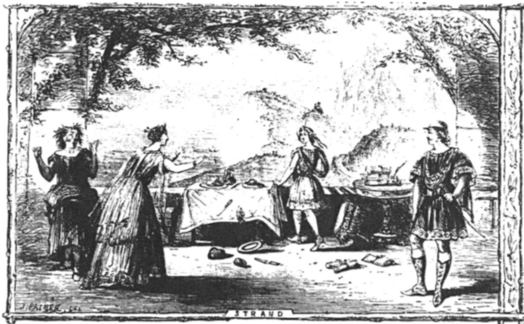
Fig. 4. Orpheus and Eurydice quarrel in an early scene from Henry Byron's Orpheus and Eurydice . Engraving reproduced from the Illustrated London News , vol. 44, no. 1239 (2 January 1864), p. 7.

The whole success of the piece was made by dressing up good-looking girls as immortals lavish in display of leg, and setting them up to sing and dance, or rather kick wretched burlesque capers. 73