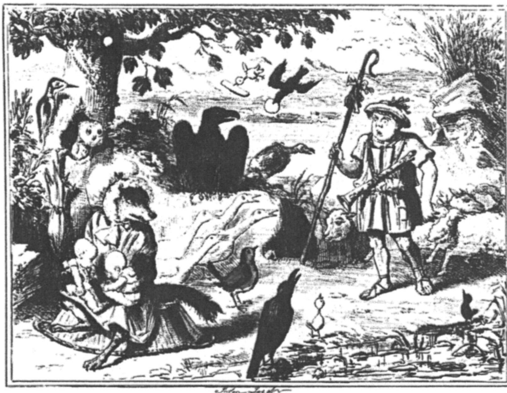
Fig. 6. 'Romulus and Remus discovered by a gentle shepherd.' Frontispiece, by John Leech, to Gilbert Abbot à Beckett's The Comic History of Rome (London 1852).

tions for how to paint a scene-cloth depicting the Leucadian Rock from which Sappho can leap. 134