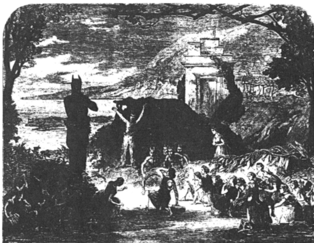
WEST END OF THE NEW REPRESENTATIONS OF "PAN," AT THE ANGLICAN THEATRE.—SEE PRINTING PAGE.

Fig. 5. The apparition of Pan, attended by satyrs, at the climax of Henry Byron's Pan; or, the Loves of Echo and Narcissus . Engraving reproduced from the Illustrated London News , vol. 46, no. 1313 (6 May 1865), p. 424.